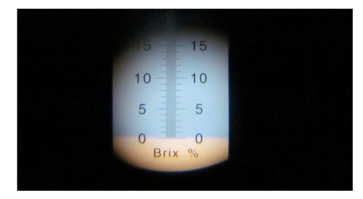
Winemakers, vegetable processors, and many other members of the food industry use °Brix to describe sugar or soluble solids content.

Four fact sheets have been prepared to guide farmers and produce buyers in using °Brix as an indicator of vegetable quality. This overview provides important background information on °Brix, outlines its application in horticultural crop production, and describes the benefits and limitations of measuring °Brix during vegetable